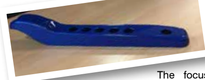
Fig4 HAI Armrest, HFQ® formed at PAB.

The focus of the first HFQ® aircraft components is an interior component, seat armrest, in Fig 4. Despite high draw depth, steep draft angle and tight bend radii, it was successfully formed from both AA6082 and AA7075 through the HFQ® process. High strength aluminium alloys offer significant weight savings, which can be translated into increased payload and reduced fuel consumption. Understandably, this new demonstration of HFQ® technology has generated a lot of interests from the aerospace industry.