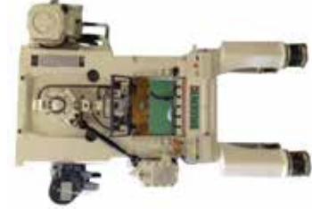
○ Pre-owned BSTA 25H