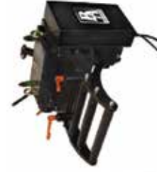
○ State of the art Servo Feeds