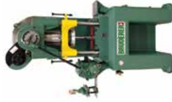
○ Pre-owned BSTA 30