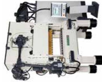
○ New BSTA 410

Not only do we supply new and refurbished high speed presses, but also the 'best of the rest' with regards to press shop equipment and precision tooling components for press & plastic mould tools