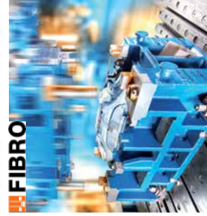
○ Tooling and gas springs for press and plastic mould tools