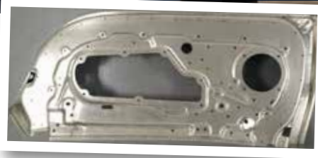
Fig2 Lotus Door Inner, HFQ® formed at AP&T.