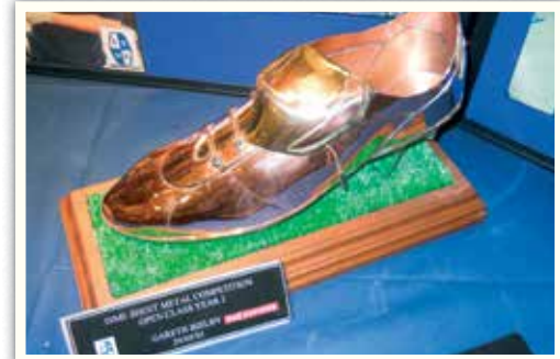
Example from previous Competition

This component can be made to the 2D drawing or if requested we can provide a 3D CAD model ( email adriannicklin@btinternet.com ).