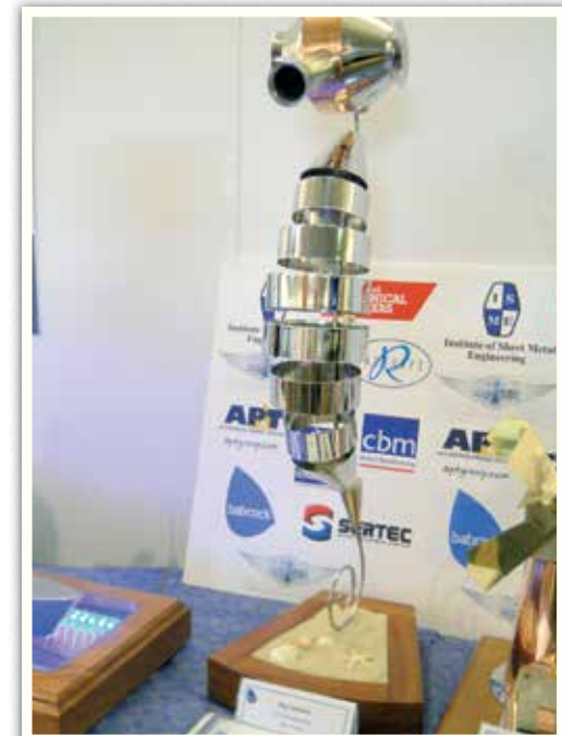
Example from previous Competition