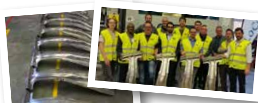
Fig3 Fiat B-Pillars, HFQ® formed at AP&T.

Fig 3 shows another example of HFQ® in forming complex-shaped parts, Fiat B-Pillar. As a safety critical component, the strength is critically important. This part was successfully and repeatedly formed from both AA6082 and AA7075. The ultra-high strength aluminium alloy AA7075 can reach more than 500MPa UTS after artificial ageing.